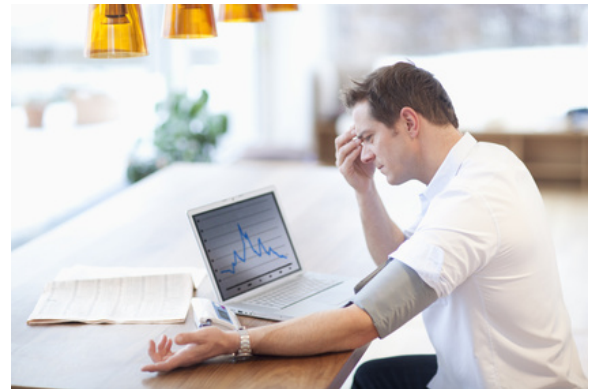
Figure 1: Essential Hypertension Affects 60 Million Americans - Yet Is Of Unknown Origin?