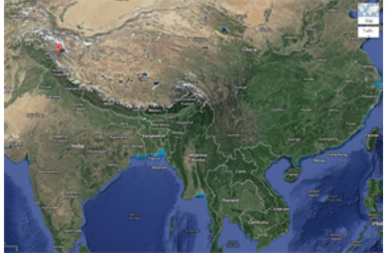
Kashmir, situated in northern India and southwest of Tibet and China.

For me, Kashmiri Shaivism offers a purest and most essential “notion” of enlightenment, one that I find particularly accessible. I hope you will too.