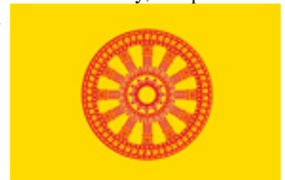
Figure 3: Thai Buddhist Symbol

divides us symmetrically that the field is strongest, extending around us like a wheel. The natural inclination of the crown chakra is to reach upward, like all land based plant life. At the other end of the spectrum, the opposite is true, i.e. the sacrum or “root” chakra naturally reaches downward, again assuming a vertical orientation of the body. (It’s really in the direction of the vertical axis of the body, in that it works the same way whether body position is vertical or horizontal.)